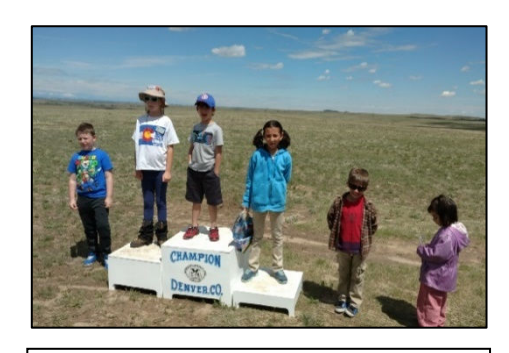
Here's how the Kids' Contest Guillow's Rubber event shook out. Hopefully, we'll see all those bright, smiling faces back again.