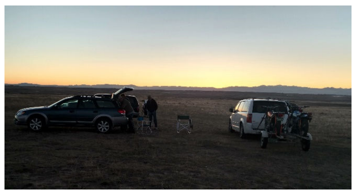
The perfect end to a perfect day of autumn flying. Some of us just had to linger as the sun went down. It was that kind of day.