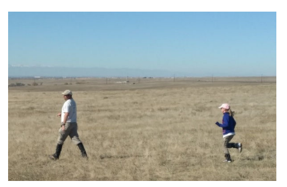
And off they go! Skilly rushes to catch up with Dad as they begin the chase. She won the Scramble, with three nice maxes.