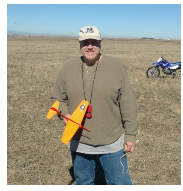
Tom Norell's P-59 Airacomet for Jet Cat is a beauty. The finish, including panel lines, is exquisite. Still undergoing fine trimming, it's obviously potent.