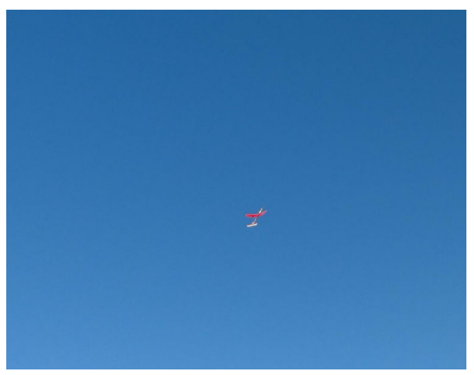
The Soaring Falcon lives up to its name! Skilly DeLoach's P-30 on the climb-out for a max. How blue was our sky? See for yourself.